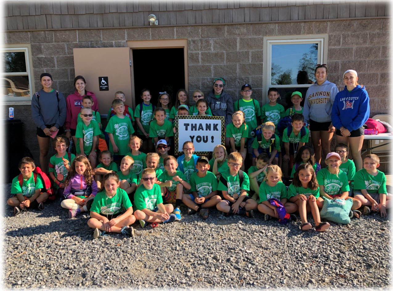
Penn State Cooperative Extension summer workers facilitate STEM program throughout the summer.