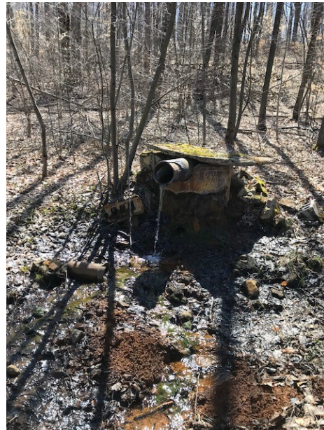
A former vent shaft for an abandoned coal mine in West Creek. Due to the alterations from deep mining many years ago, the abandoned mines in West Creek have filled with groundwater. The groundwater comes into contact with leftover coal, becomes acidified, dissolves metals, and leaves the mine through this former air vent.