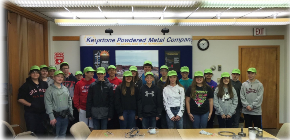
St. Marys Area School District's 7th graders visited Keystone Powdered Metals as part of their Intro to Manufacturing program.