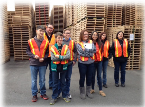
Left photo: St. Marys Area Schools District's 7th graders teamed up with Penn Pallet to produce a video as part of the statewide What's So Cool About Manufacturing contest.