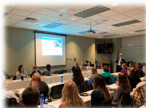
Right photo: Current college students and high school seniors interested in health careers heard about a variety of careers from Penn Highlands Elk professionals.