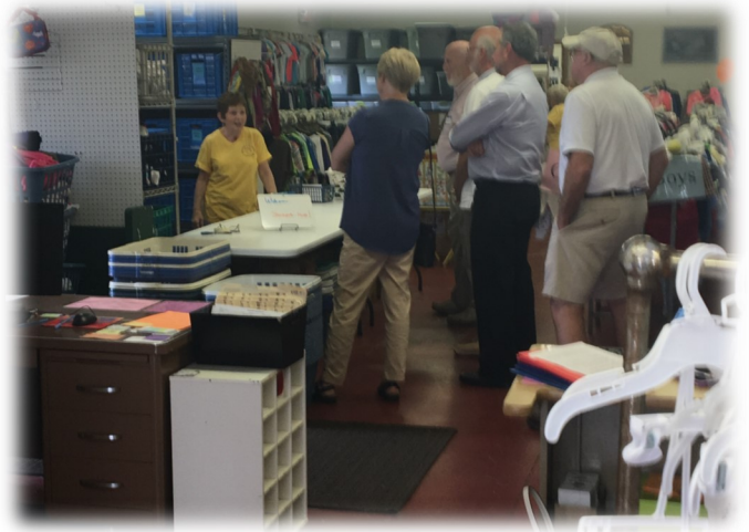
Trustees and family visit the Guardian Angel Center during their August 2018 retreat.