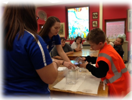
Left photo: Domtar and the Elk County Conservation District joined St. Marys Area School District's 5th graders to conduct water quality tests during the Careers Showcase program.