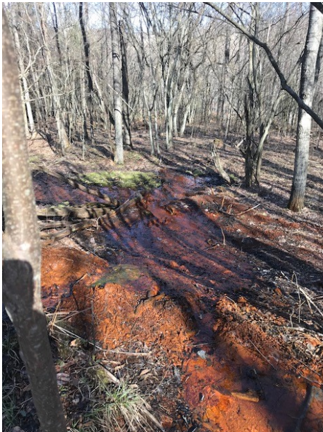
Looking downhill at an acid mine drainage seep on West Creek. Water from abandoned mine seeps is often acidic and contains metals. As water seeps from the hillside, it deposits iron and turns the sediment orange. The iron has formed a hard, thick crust on the sediment over time.

Bennett's Branch Forest– Educational Kiosk $7,500