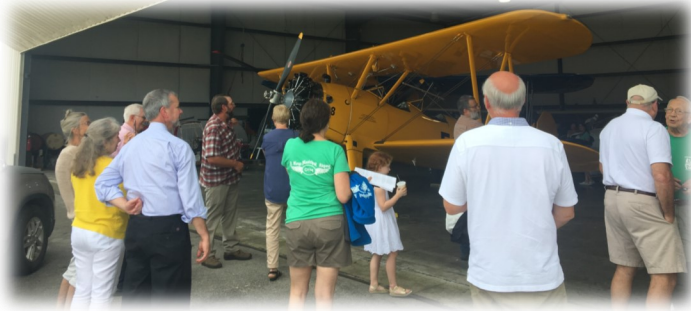
Trustees and family visit to the St. Marys Airport