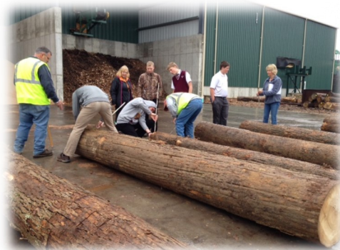
Right photo: Students from Elk County Catholic High School measured logs and learned applications of geometry during Geometry in the Workplace at the St. Marys Lumber Company this past fall.